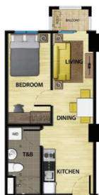
1-Bedroom Unit (Tower 1)