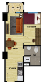
1-Bedroom Unit (Tower 1 & 2)